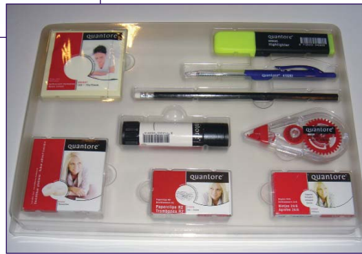
Figure 3: Mould Inlay promobox office equipment

understand issues in manufacturing. Batelaan provides customers with support from design through manufacturing, and SpaceClaim has quickly become a vital tool to design new products, tweak customer models, and create molds from them. By direct modeling in a combination of SpaceClaim's cross section and 3D editing capabilities, Ed is able to easily adjust the customers' designs so the round radii, draft angles, and scale are correct. For plastic that becomes stretched, Ed can adjust the material thickness base on his proprietary rules, helping guarantee the accuracy of parts the first time. Once the parts are correctly designed, Ed prepares the mold using SpaceClaim's Volume Extract tool on the core of the part, adding vacuum holes in strategic locations.